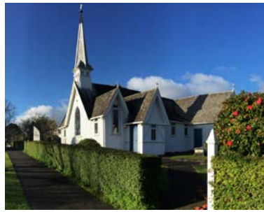
St Andrew's Church. Epsom

E te Atua te kaihōmai o te ora me te mārāma, pīataata ana tēnei pō tapu, e kānapanapa ana te Karaiti kua ara mai nei; whakahōutia tāu Hāhi ki te Wairua i hōmai e ō mātou iriiringa, kia tika, kia pono tā mātou whakamoemiti ki a koe, kia tīaho ai mātou hei māramatanga i te ao; Ko Īhu Karaiti tō mātou Ariki, e ora ana, e kīngi tahi ana me koe me te Wairua Tapu, kotahi anō Atua, ināianeī, ā, mō ake tonu atu. Āmine.