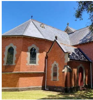
St Barnabas Church, Mt Eden

E te Atua mutunga kore, ko tāu Tama ko Īhu Karaiti te huarahi, te pono, me te ora mō ngā mea katoa; Hōmai ki a mātou he ngākau atawhai kia hīkoi ai i tāna huarahi, kia harikoa ai i tōna pono, kia whai wāhi ai ki tōna oranga; ko ia e ora ana, e kīngi tahi ana me koe me te Wairua Tapu, kotahi anō Atua, ināianeī, ā, mō ake tonu atu Āmine.