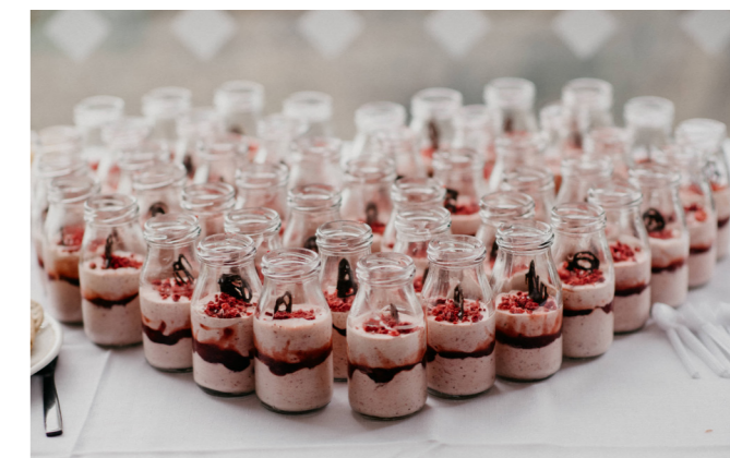
Above: Refreshments being served in the Visitors' Centre

The Bishop Monteith Visitors' Centre, adjacent to the Cathedral, offers a space for serving light refreshments after your ceremony. This must be booked separately at the time you book your wedding at a cost of $460 inc. GST. The Bishop Monteith Visitors' Centre has kitchen facilities (non-commercial). This space has the capacity to seat 100 or holds 250 standing inside and outside under the colonnade. Your caterer will need to provide all glasses, crockery and cutlery. Please note that refreshments cannot be served anywhere inside the cathedral or St. Mary's, outside in the cathedral grounds, or in St. Stephen's Chapel. Please contact the Cathedral office to find out if this space is available on the day of your wedding and to book.