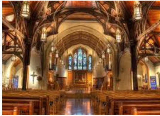
Image: Christ Church Cathedral, Diocese of New Westminster, Vancouver, Canada.