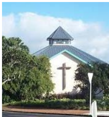
Church of the Saviour, Blockhouse Bay

E te Atua mutunga kore, ko koe te mārāma o te hinengaro e mōhio nei, ko koe te hari o te ngākau e aroha nei, ko koe te kaha o te whakaaro e mahi nei mōu; tukua mai ki a mātou te mōhiotanga ki a koe kia tino aroha ai mātou ki a koe, mā te aroha ki a koe ka tika ai tā mātou mahi i runga i te harikoa, āiane, ā, ake tonu atu. Āmine.