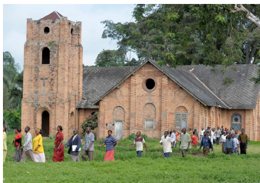
Image: Residents of the Congolese village of Wembo Nyama walk from a worship service in the United Methodist Church.