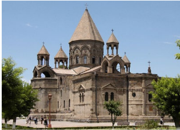
Image: Etchmiadzin Cathedral, the Mother Church of the Armenian Apostolic Church