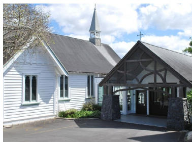
Image: St Aidan's Church, Remuera

E Īhu, mārama o te ao, meinga kia tīaho tōu whetū mārama ki runga iho i te wāhi e noho ai te rawakore; arahina ō mātou tohunga ki te whakaaro nui, ō mātou rangatira ki te whakaaro pai. Whakarongo ki tēnei inoi i runga i tōu aroha. Āmine.