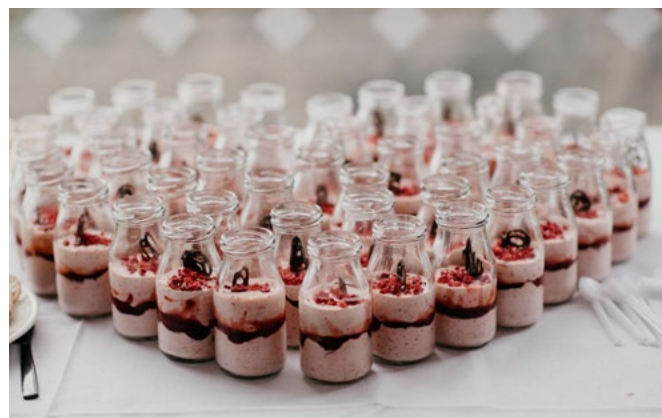
Above: Refreshments being served in the Visitors' Centre

The Bishop Monteith Visitors' Centre, adjacent to the Cathedral, offers a space for serving light refreshments after your ceremony. This must be booked separately at the time you book your wedding at a cost of $575 inc. GST. The Bishop Monteith Visitors' Centre has kitchen facilities (non-commercial). This space has the capacity to seat 100 or holds 250 standing inside and outside under the colonnade. Your caterer will need to provide all glasses, crockery and cutlery. Please note that refreshments cannot be served anywhere inside the cathedral or St. Mary's, outside in the cathedral grounds, or in St. Stephen's Chapel. Please contact the Cathedral office to find out if this space is available on the day of your wedding and to book.