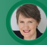
Rt Hon Helen Clark Former Prime Minister of New Zealand and Former Administrator of UNDP Hope for our World