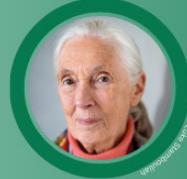
Dr. Jane Goodall, DBE Founder - the Jane Goodall Institute & UN Messenger of Peace Hope for an Endangered Planet