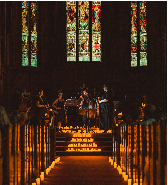
Image: Candlelight: Vivaldi's Four Seasons in St Mary's-in-Holy Trinity

For up to date details of all special services and events, please check the Holy Trinity Cathedral website: www.holy-trinity.org.nz/special-service-and-events-calendar